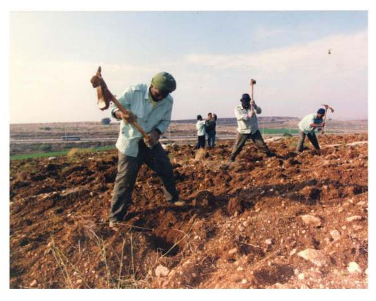
'The festival that has survived the hostile interference of men and nature, just like Am Yisrael's steadfastness through the centuries, has been revived and brings us renewal once again.'

"Boys and girls, the Jewish people has been dreaming for 2,000 years to return to Eretz Yisrael. The countries of the world feel guilty about what they did to us. Maybe those countries all over the world will give us a chance. Then together we sang with great enthusiasm, "Am Yisrael Hai."