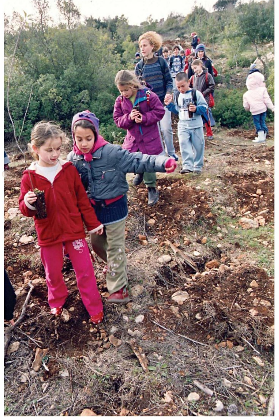
Children get close to the land on Tu Bishvat, 2005.