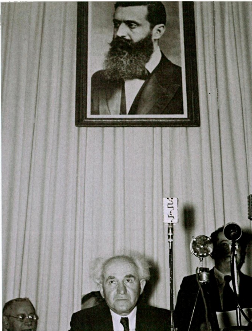
Israel's first prime minister David Ben-Gurion sits under a portrait depicting Theodor Herzl, the father of modern Zionism, before the reading of Israel's Declaration of Independence in Tel Aviv on May 14, 1948

generation, circumstances are changing. Without the religious and community glues, and absent the national connection that previously existed, mainstream American Judaism is now on a path of evaporation.