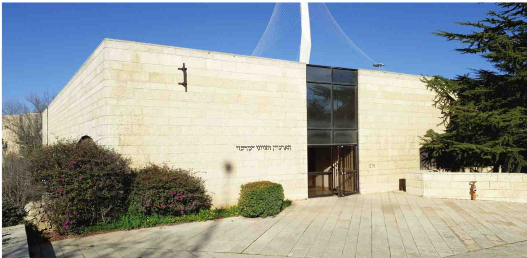
CENTRAL ZIONIST Archive, 2019. (Copyright Shalom Rabani)