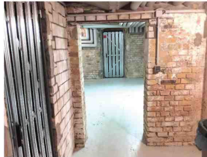
CATACOMB-LIKE basement of Meinekestrasse 10 in 1919.