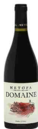
▲ Domaine Netofa Red, 60 NIS