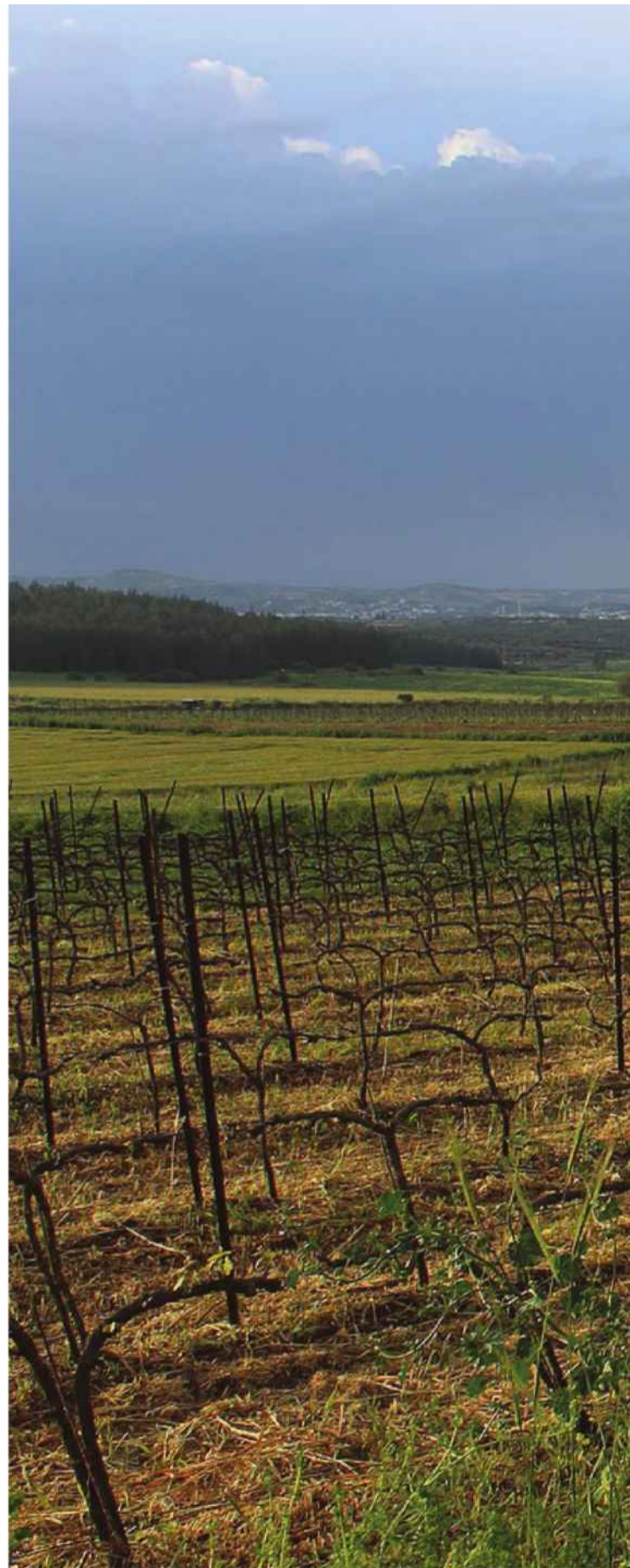
▲ View of vineyard and fields in the largely agricultural district of the Adullam region.

Rabbi Hiyya, who coined this phrase, explained,