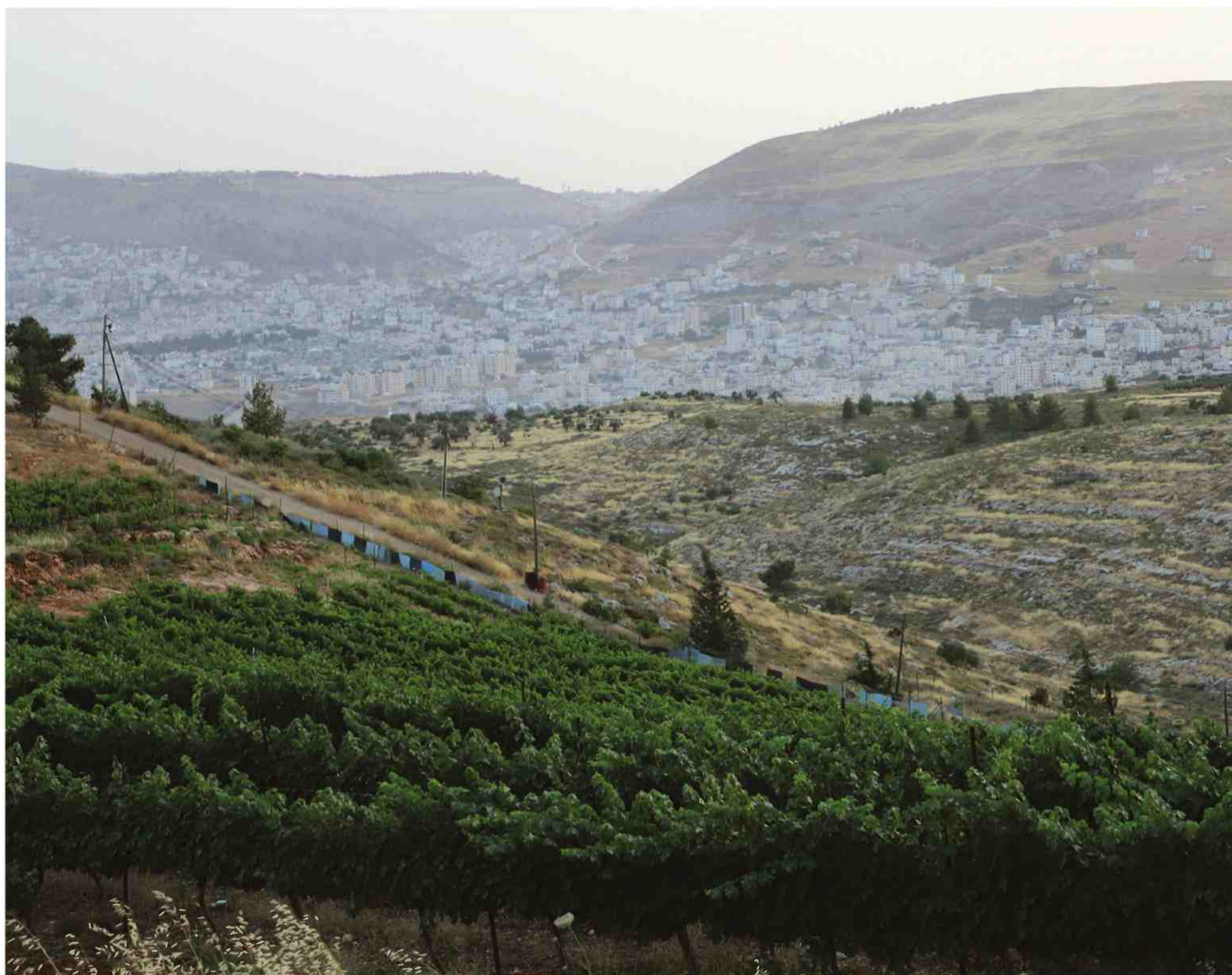
▲ Vineyards of Kabir winery in Elon Moreh on Derech Avot.

a taste of local cognac [a spirit distilled from wine]. Perhaps the concept of the Jewish state was planted in this bottle.”