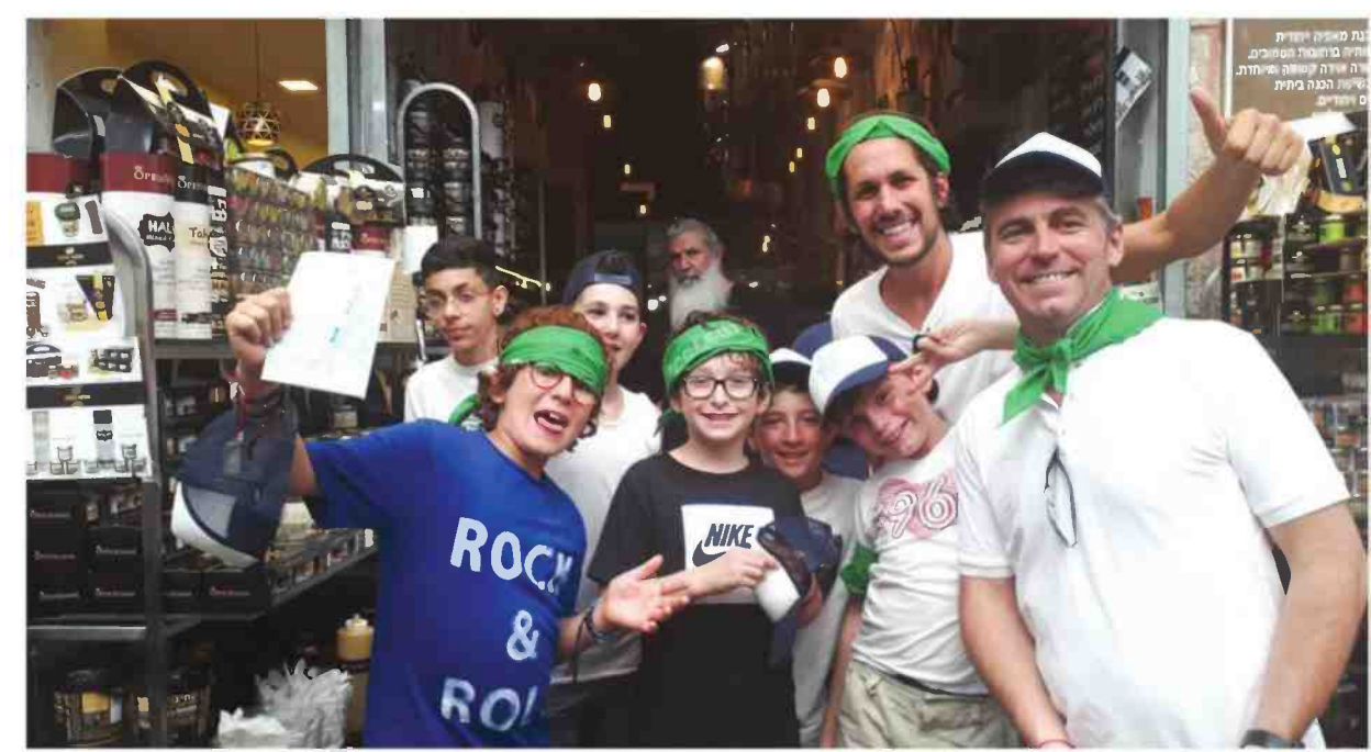
SHUK DASH shenanigans.

Address:15 Sderot Hameyasdim Kosher: Some restaurants