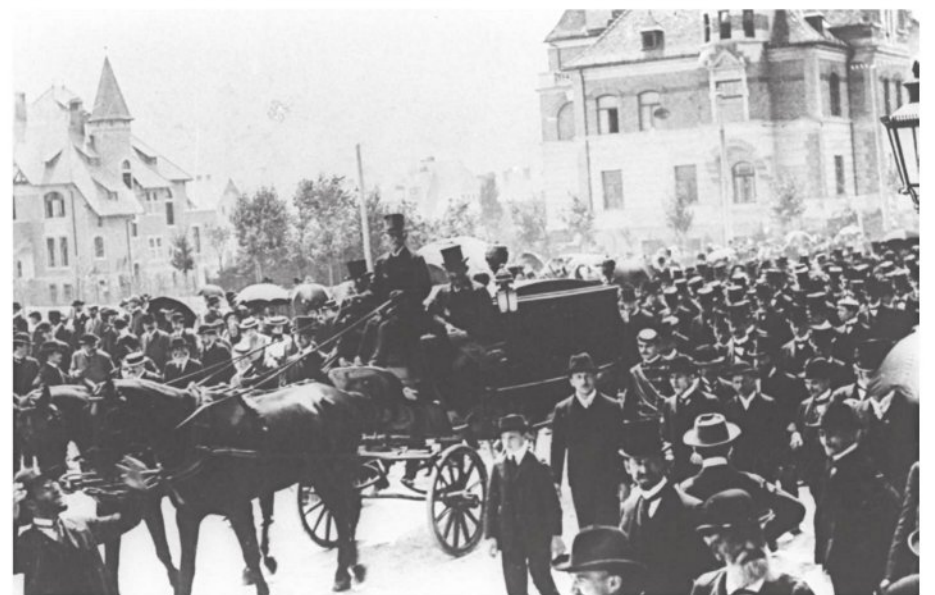
THEODOR HERZL'S funeral in Vienna, July 7, 1904.

The trip required choreography. The president needed a formal invitation from a head of state. The prime minister