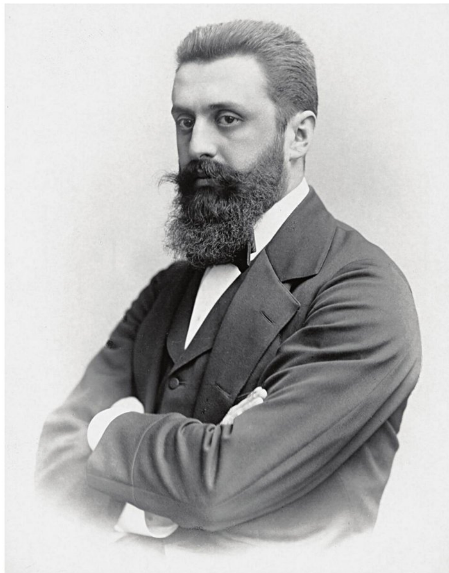
figure. There were rabbis, many rabbis, in both East and West, who preceded him. He was the practical one." He paused. "From our perspective, Zionism did not begin in 1897. That was its outstanding achievement, but it came from somewhere. That's the connection we want to make."

The numbers have narrowed faster than most people realize. Israel's Jewish population stands at approximately 7.76 million. The worldwide Jewish population is estimated at 16.5 million, with the US home to roughly 6.3 million. Israeli Jewish births surged 74% between 1995 and 2025, from 80,400 to nearly 140,000 annually, according