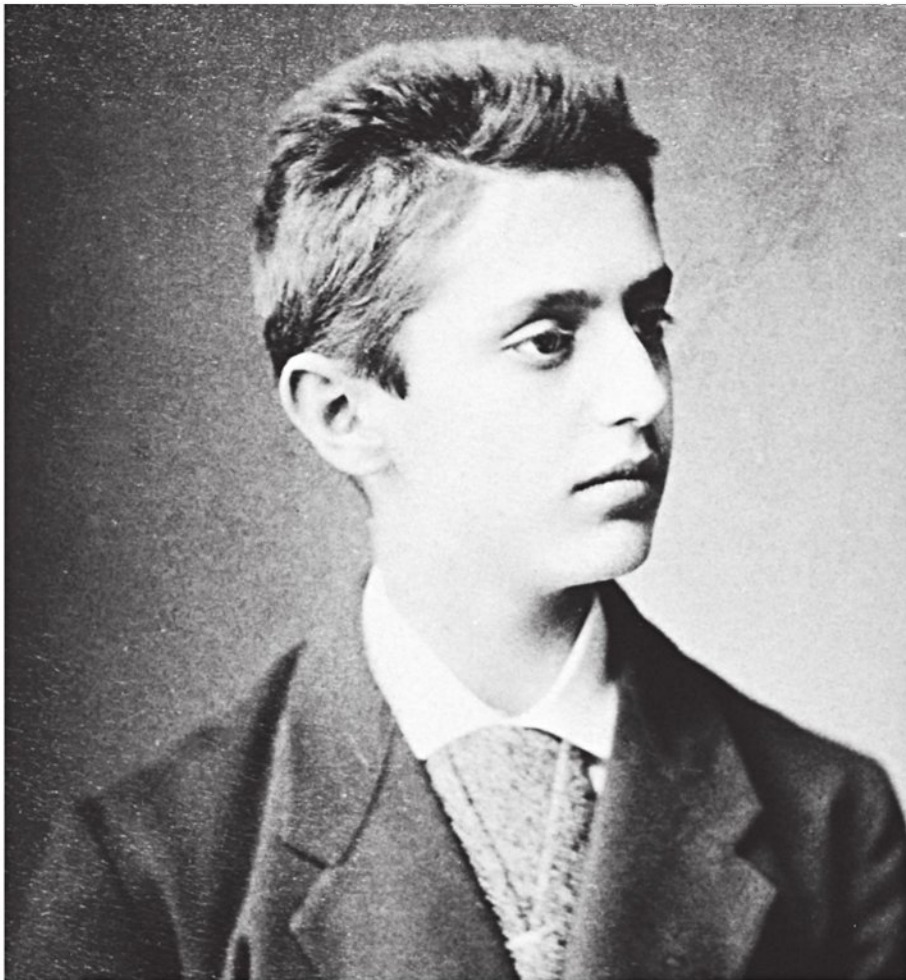
YOUNG THEODOR, a high school student, ca. 1875.

: Inside the campaign to bring the founders grandparents to Mount Herzl